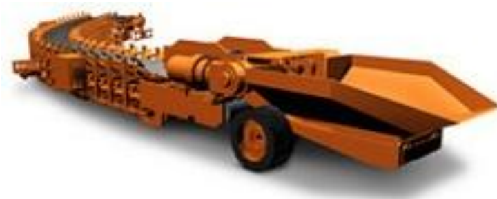
Figure 2 - 4FCT01 (Joy, 2008)

The Joy 4FCT01 (Figure 2) is available in lengths up to 128 m and requires one operator.