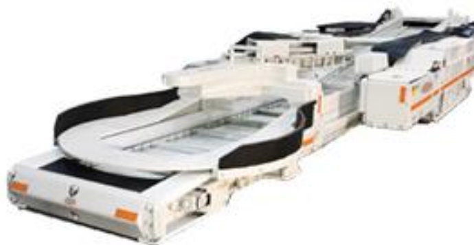
Figure 3 - Joy continuous chain haulage (Joy, 2010)

Chain conveyors (Figure 3) consist of four basic units: a breaker car module, conveyor bridge module, mobile bridge module and rigid haulage system. The system configuration and number of these units depends on individual mine application and production requirements. Systems can be up to 200 m of flexible chain conveyor with a feeder breaker behind a continuous miner. From the chain conveyor the coal is transferred via a belt interface onto the section belt. Chain conveyor systems often have a lower profile and thus are more suitable for lower seam workings.