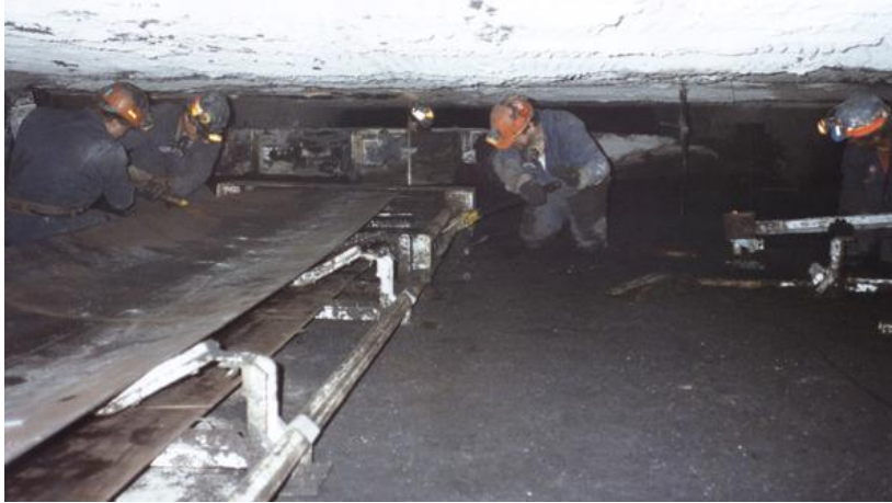
Figure 4 - Temporary belt support (S and S Sliders, 2011)

Joy's system requires a take up unit and has a length of 12 m, where CONSOL's temporary belt support system is 80 m long and has an optional take up unit. There is the potential for the continuous miner to be connected directly to the section conveyor when driving the belt road.