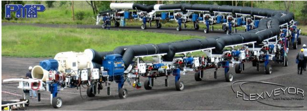
Figure 1 - Flexiveyor linear mining system (Diversified Mining Services 2010) flexible belt conveyor

Various flexible conveyor trains have been produced including both floor mounted and roof mounted continuous conveyor systems. Both systems offer some degree of operational flexibility. The discharge end of the flexible conveyor runs above the section conveyor. This enables the flexible conveyor to discharge onto the section conveyor as the flexible conveyor follows the continuous miner through the development sequence. The face end of the flexible conveyor is attached to the rear of the continuous miner or is self-propelled and kept at that position. Both roof and floor mounted flexible conveyor systems were trialled in Australian mines during the late 1980's with limited success.